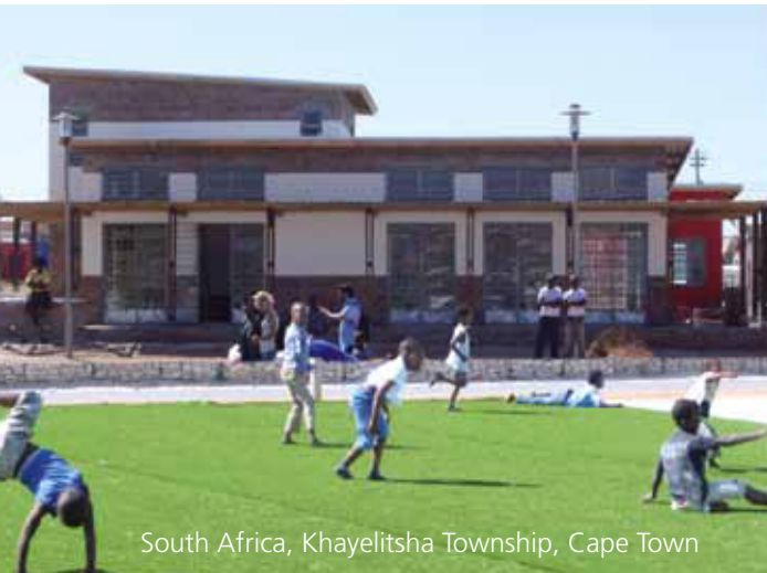
South Africa, Khayelitsha Township, Cape Town

"20 Centres for 2010" is the official campaign of the 2010 FIFA World Cup South Africa™. Its aim is to achieve positive social change through football by building twenty Football for Hope Centres for public health, education and football across Africa. The centres will address local social challenges in disadvantaged areas and help improve education and health services for young people. "20 Centres for 2010" will promote social development through football long after the final whistle of the 2010 FIFA World Cup™, leaving a tangible social legacy for Africa.