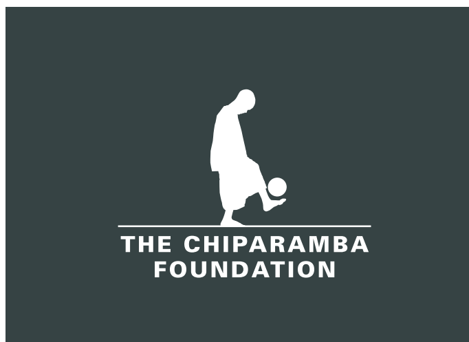
Wallace transformed into a logotype, a symbol to use football as a tool against hiv/aids.