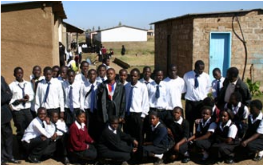
Here are some of the Chiparamba players and their sisters in Jarmy School.