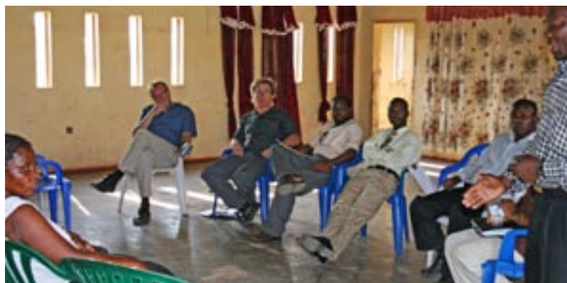
The importance of finding a balance between football and studies was discussed at the big meeting.