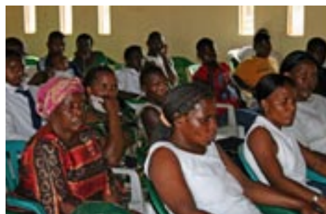
Parents and sponsored children listen carefully during the big meeting.