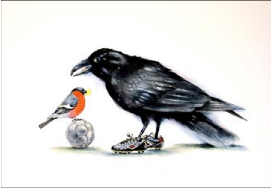
Lasse Åberg's lithograph "League Football" is printed in six colors, on a 300 gram paper, in an edition of 290 copies. The Chiparamba Foundation has 100 of these lithographs and the proceeds go to the Foundation. The price is 350 $. Orders should be submitted to info@chiparamba.com .