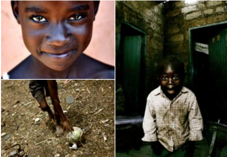
The Foundation has the rights to numerous photographs with varied subjects from Lusaka of superb quality. Price and sizes after agreement. Interest should be submitted to info@chiparamba.com .