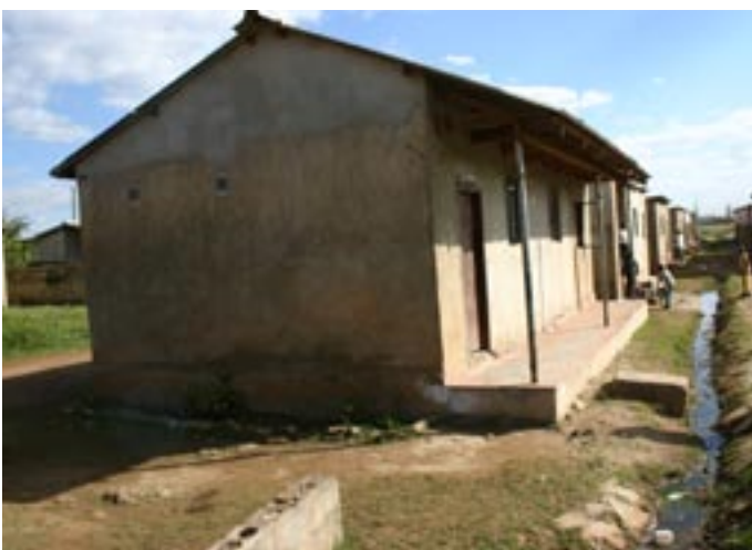
Some 850 pupils attend Jarmy School in downtown Lusaka. This education is much more successful than in the Government schools.