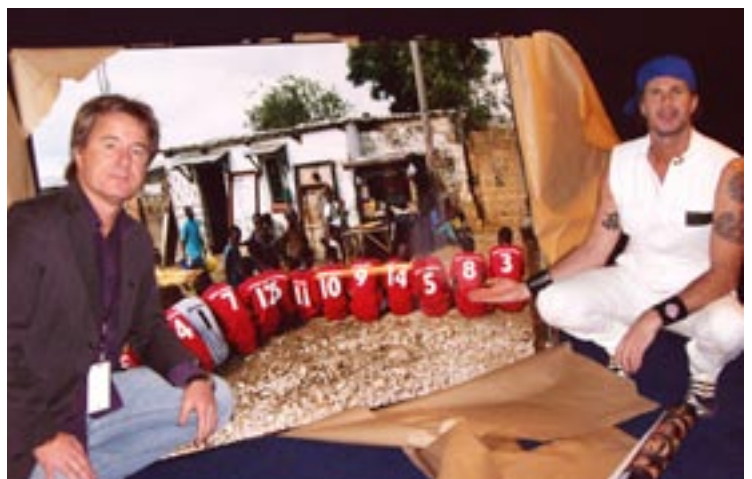
Klas and Chad Smith in the Red Hot Chili Peppers' dressing-room at the Globe Arena in Stockholm just before the band's show.