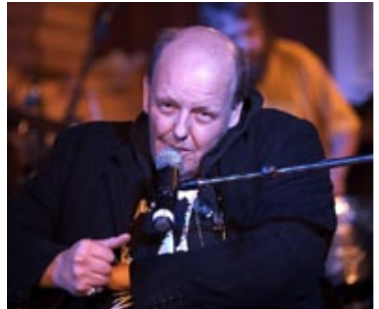
Freddie Wadling, singer, actor and artist.