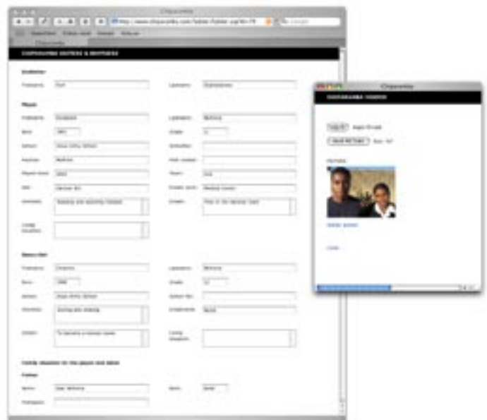
The database keeps track of all the information surrounding "Chipa Sisters & Brothers".

Our sincere thank you for your exceptional patience, all of you sponsors who still have not got correct information about your orphans. Your generosity and enormous involvement in the Foundation has been very important when we have been building up "Chipa Sisters & Brothers."