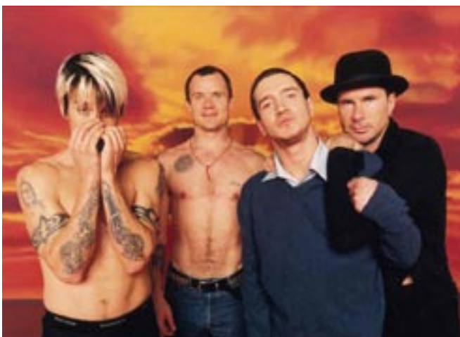
Today the Red Hot Chili Peppers are one of the world's leading rock bands.