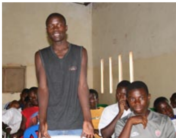
One of the Chiparamba players takes part in the discussion.