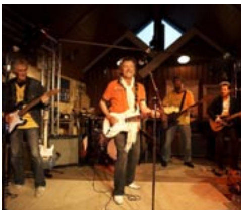
What a great band!