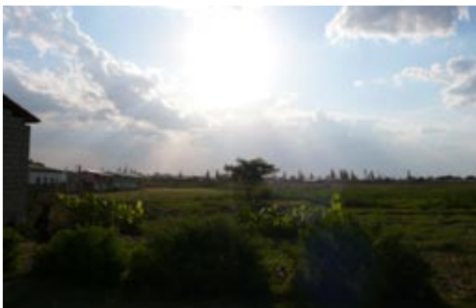
This swamp next to Jarmy School will be turned into a footballfield if all goes well.