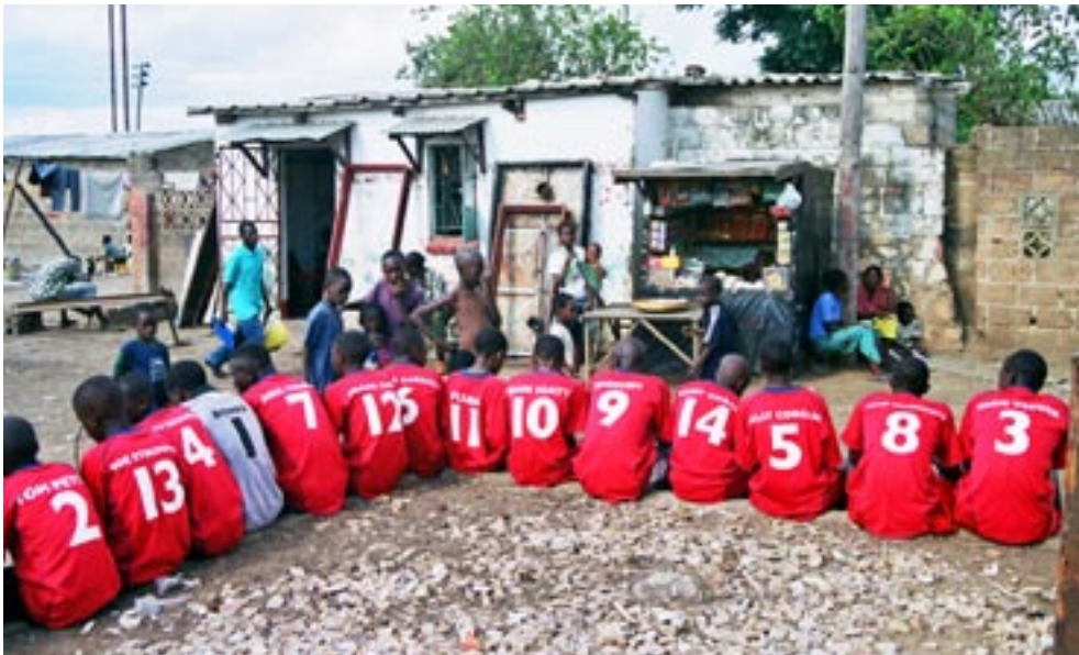
This picture of the Chiparamba Great Eagles was taken in Lusaka in 2004. Today it hangs in the Café Opera in Stockholm among other places.