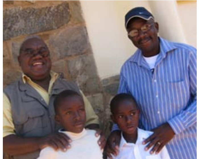
The chairman of the Chiparamba Great Eagles and Zambia's Youth & Sports Minister