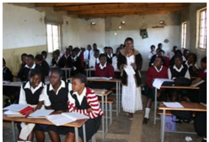
School uniforms are compulsory in Zambian schools. This is an inheritance from the British colonial days.