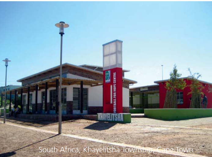
South Africa, Khayelitsha Township, Cape Town

"20 Centres for 2010" is the official campaign of the 2010 FIFA World Cup South Africa™. Its aim is to achieve positive social change through football by building twenty Football for Hope Centres for public health, education and football across Africa. The centres will address local social challenges that young people face in disadvantaged areas by helping to improve education and public health services. "20 Centres for 2010" will promote social development through football long after the final whistle of the 2010 FIFA World Cup™, leaving a tangible social legacy for Africa.